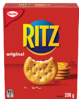
CHRISTIE RITZ OR WHEAT THINS CRACKERS 180 - 386 G SELECTED VARIETIES