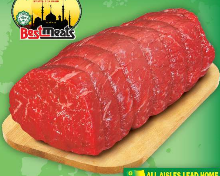
FRESH HALAL BONELESS OUTSIDE ROUND ROAST VACUUM PACK 16.51/KG

ALL AISLES LEAD HOME KITCHENS OF THE WORLD 7.49 /LB