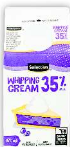
SELECTION CREAM 473 ML - 1 L SELECTED VARIETIES