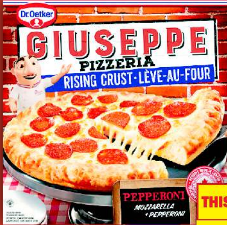
DR. OETKER GIUSEPPE RISING CRUST PIZZA 720 - 785 G EASY PIZZI 560 - 600 G FROZEN SELECTED VARIETIES