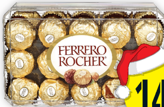
FERRERO ROCHER CHOCOLATE BOX 375 G SELECTED VARIETIES WHILE QUANTITIES LAST