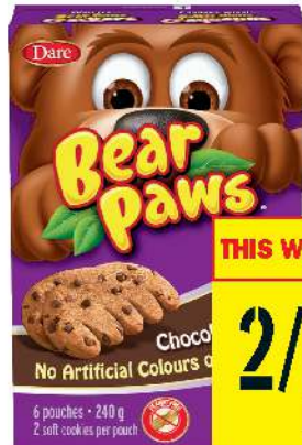
DARE ULTIMATE OR BEAR PAWS COOKIES 168 - 350 G SELECTED VARIETIES