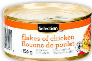
SELECTION FLAKES OF CHICKEN OR HAM 156 G SELECTED VARIETIES