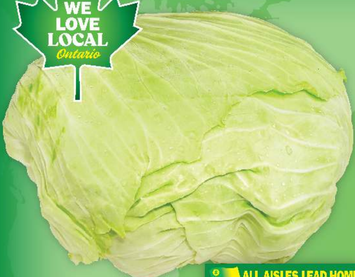
FLAT CABBAGE PRODUCT OF ONTARIO CANADA NO. 1 GRADE 2.16/KG

ALL AISLES LEAD HOME KITCHENS OF THE WORLD 98¢ /LB