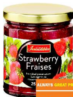
IRRESISTIBLES SPREAD 250 ML SELECTED VARIETIES