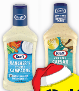
KRAFT SALAD DRESSING 475 ML SELECTED VARIETIES