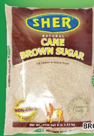
TATA TEA 220'S SHER BROWN SUGAR 3.62 KG SELECTED VARIETIES

ALL AISLES LEAD HOME KITCHENS OF THE WORLD 2.99 EACH