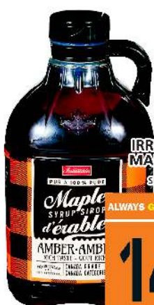
IRRESISTIBLES MAPLE SYRUP 946 ML SELECTED VARIETIES