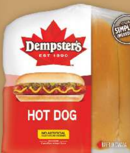
DEMPSTER'S WHITE OR 100% WHOLE WHEAT BREAD 675 G HOT DOG OR HAMBURGER BUNS PACK 8 SELECTED VARIETIES OR PAY $2.99 EA.