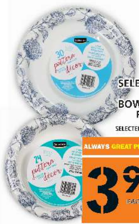
SELECTION PAPER BOWLS OR PLATES 24 - 30'S SELECTED VARIETIES