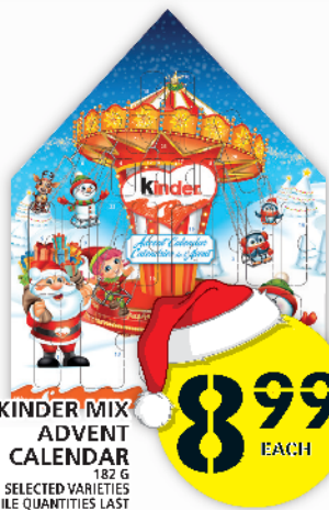
KINDER MIX ADVENT CALENDAR 182 G SELECTED VARIETIES WHILE QUANTITIES LAST