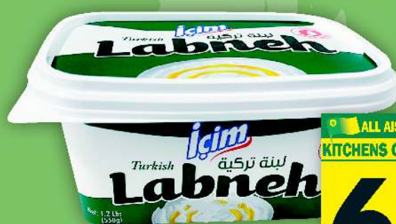
ICIM TURKISH LABNEH 550 G

ALL AISLES LEAD HOME KITCHENS OF THE WORLD 3/$5