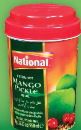
NATIONAL PICKLES 950 ML SELECTED VARIETIES

ALL AISLES LEAD HOME KITCHENS OF THE WORLD 2.49 EACH