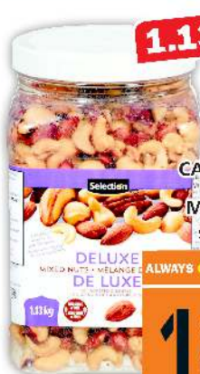
SELECTION CASHEWS OR DELUXE MIXED NUTS 1.13 KG SELECTED VARIETIES