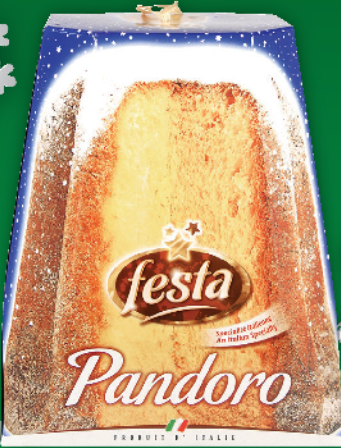
FESTA PANDORO OR PANETTONE 750 - 908 G SELECTED VARIETIES WHILE QUANTITIES LAST