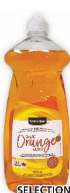
SELECTION DISH DETERGENT 591 - 828 ML SELECTED VARIETIES