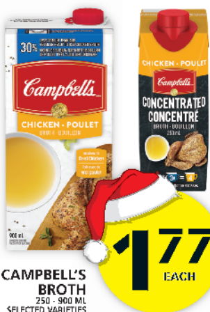
CAMPBELL'S BROTH 250 - 900 ML SELECTED VARIETIES