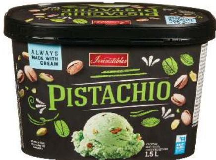
IRRESISTIBLES ICE CREAM 1.5 L NOVELTIES 4'S SELECTED VARIETIES