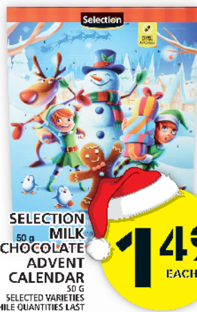
SELECTION MILK CHOCOLATE ADVENT CALENDAR 50 G SELECTED VARIETIES WHILE QUANTITIES LAST