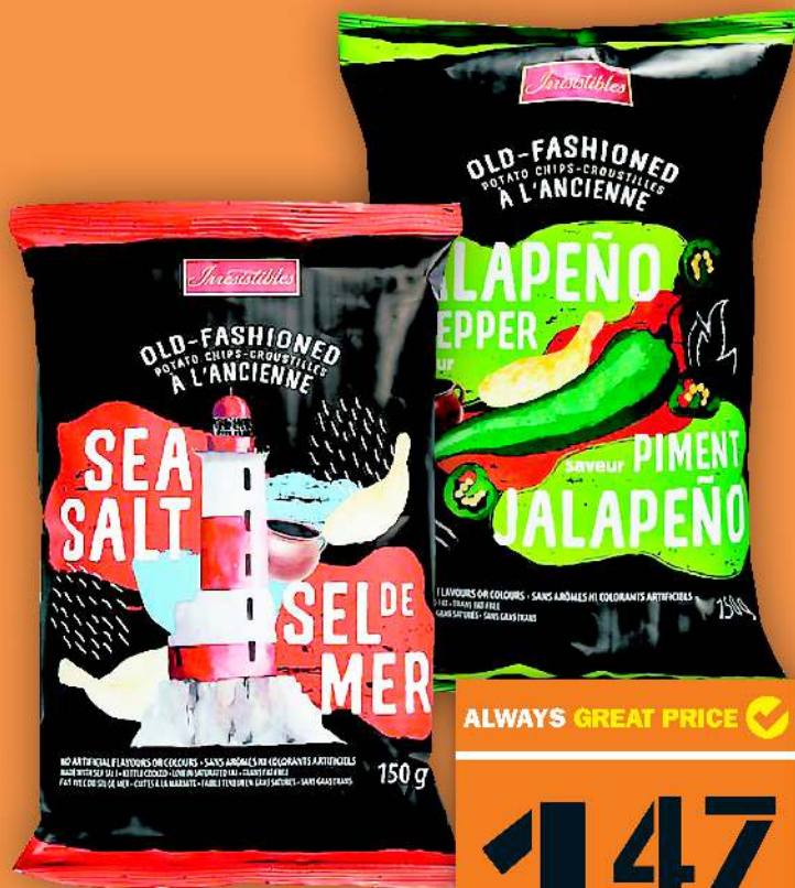
IRRESISTIBLES POTATO CHIPS 150 G SELECTED VARIETIES