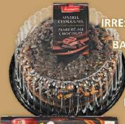
IRRESISTIBLES FULLY BAKED PIES 750 G - 1 KG, COFFEE CAKES 850 G OR 10" PUMPKIN PIE FROZEN 900 G SELECTED VARIETIES