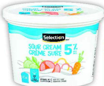
SELECTION sour cream 500 ML SELECTED VARIETIES