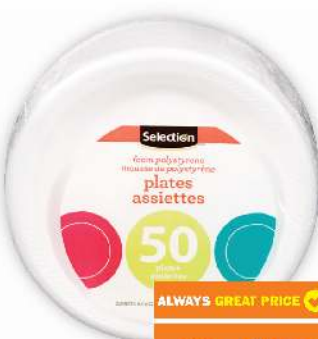
SELECTION FOAM PLATES 50'S SELECTED VARIETIES