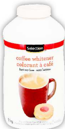
SELECTION COFFEE WHITENER 1 KG SELECTED VARIETIES