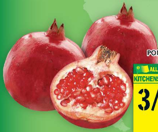
POMEGRANATES PRODUCT OF U.S.A.

ALL AISLES LEAD HOME KITCHENS OF THE WORLD 7.49 /LB