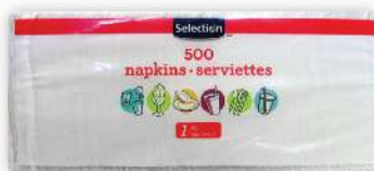
SELECTION NAPKINS 500'S SELECTED VARIETIES