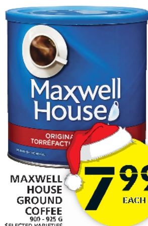
MAXWELL HOUSE GROUND COFFEE 900 - 925 G SELECTED VARIETIES