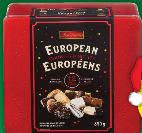
IRRESISTIBLES EUROPEAN COOKIES 650 G WHILE QUANTITIES LAST