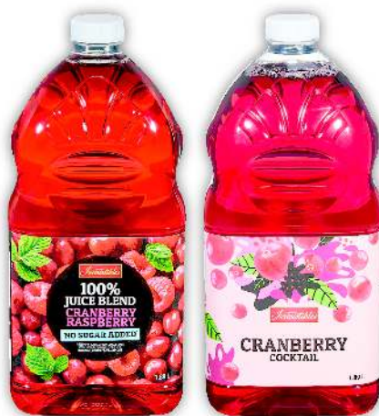
IRRESISTIBLES CRANBERRY COCKTAIL OR JUICE BLENDS 1.89 L SELECTED VARIETIES