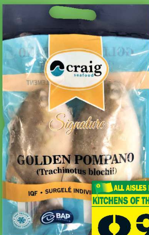
CRAIG SIGNATURE GOLDEN POMPANOS 800 G FROZEN SELECTED VARIETIES

ALL AISLES LEAD HOME KITCHENS OF THE WORLD 6.99 EACH