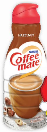
NESTLÉ COFFEE MATE COFFEE ENHANCER 946 ML SELECTED VARIETIES