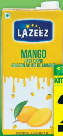
SURATI SNACKS 341 G LAZEEZ JUICE DRINK 1 L SELECTED VARIETIES

ALL AISLES LEAD HOME KITCHENS OF THE WORLD 2.49 EACH