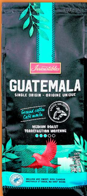
IRRESISTIBLES GROUND COFFEE 340 G SELECTED VARIETIES