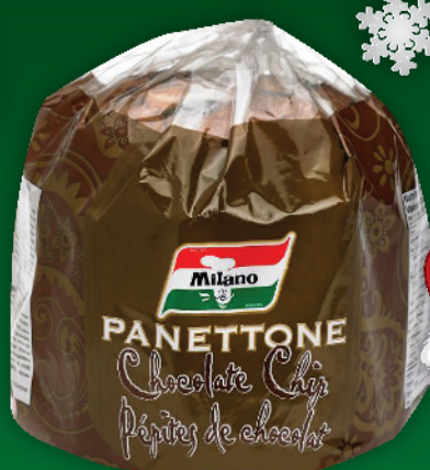
MILANO PANETTONE 800 G SELECTED VARIETIES WHILE QUANTITIES LAST