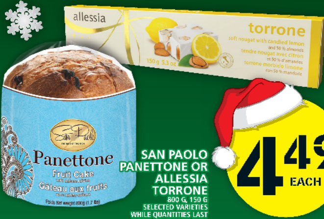
SAN PAOLO PANETTONE OR ALLESSIA TORRONE 800 G, 150 G SELECTED VARIETIES WHILE QUANTITIES LAST