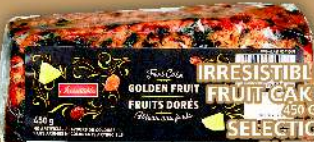
IRRESISTIBLES GOLDEN FRUIT CAKES 450 G OR SELECTION BUTTER COOKIES TRIO PLATTER 430 G SELECTED VARIETIES WHILE QUANTITIES LAST