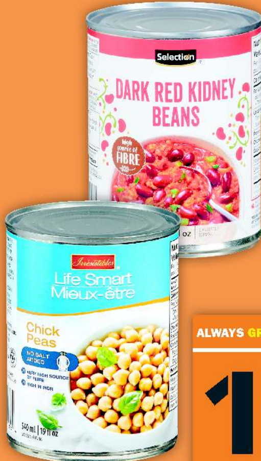
SELECTION OR IRRESISTIBLES LIFE SMART BEANS 540 ML SELECTED VARIETIES