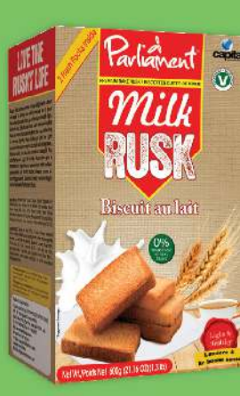
CASABLANCA BUTTER COOKIES OR PARLIAMENT MILK RUSK 454 - 600 G SELECTED VARIETIES

ALL AISLES LEAD HOME KITCHENS OF THE WORLD 7.99 EACH