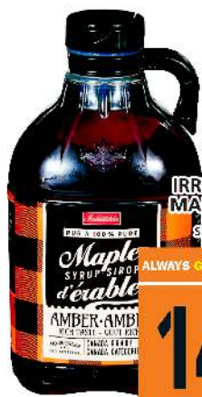
IRRESISTIBLES MAPLE SYRUP 946 ML SELECTED VARIETIES