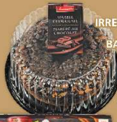
IRRESISTIBLES FULLY BAKED PIES 750 G - 1 KG, COFFEE CAKES 850 G OR 10" PUMPKIN PIE FROZEN 900 G SELECTED VARIETIES