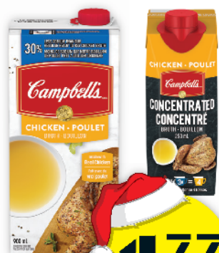
CAMPBELL'S BROTH 250 - 900 ML SELECTED VARIETIES