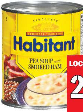
CAMPBELL'S CHUNKY OR HABITANT SOUP 515 - 795 ML SELECTED VARIETIES