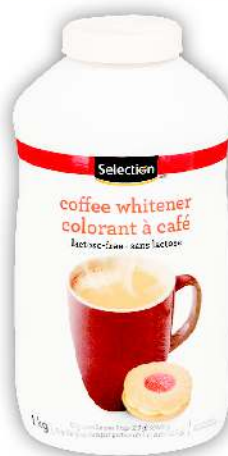
SELECTION COFFEE WHITENER 1 KG SELECTED VARIETIES