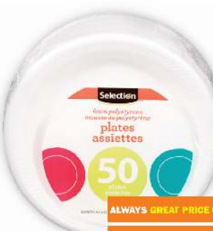
SELECTION FOAM PLATES 50'S SELECTED VARIETIES