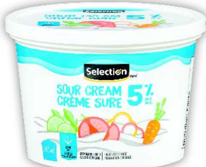
SELECTION SOUR CREAM 500 ML SELECTED VARIETIES