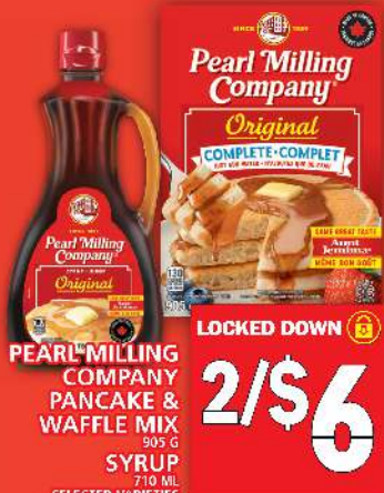
PEARL MILLING COMPANY PANCAKE & WAFFLE MIX SYRUP 905 G SELECTED VARIETIES