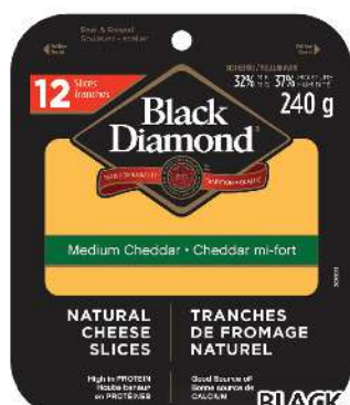
BLACK DIAMOND NATURAL CHEESE SLICES 220 - 240 G 3 X 43 G SELECTED VARIETIES