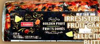
IRRESISTIBLES GOLDEN FRUIT CAKES 450 G OR SELECTION BUTTER COOKIES TRIO PLATTER 430 G SELECTED VARIETIES WHILE QUANTITIES LAST