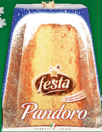
FESTA PANDORO OR PANETTONE 750 - 908 G SELECTED VARIETIES WHILE QUANTITIES LAST