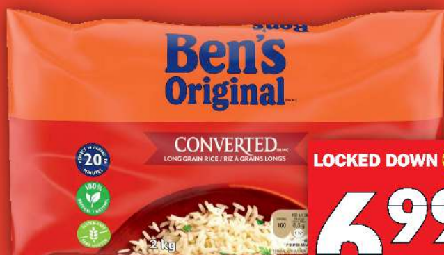
BEN'S ORIGINAL CONVERTED RICE 2 KG SELECTED VARIETIES