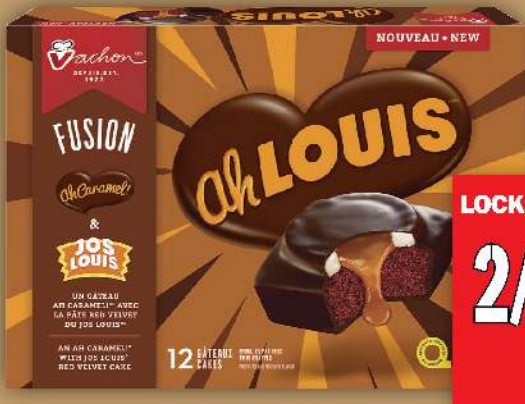
VACHON SNACK CAKES BOX OF 6 - 12 SELECTED VARIETIES OR PAY 3.69 EA.