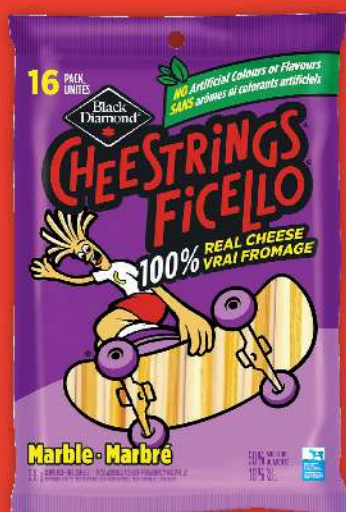
BLACK DIAMOND CHEESTRINGS OR STICKS 252 - 336 G SELECTED VARIETIES