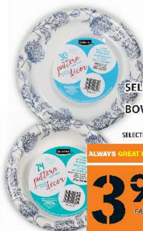
SELECTION PAPER BOWLS OR PLATES 24-30'S SELECTED VARIETIES