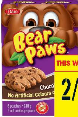
DARE ULTIMATE OR BEAR PAWS COOKIES 168 - 350 G SELECTED VARIETIES