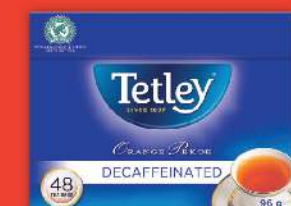
TETLEY TEA 48'S SELECTED VARIETIES