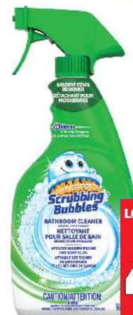
SCRUBBING BUBBLES BATHROOM CLEANER 950 ML SELECTED VARIETIES