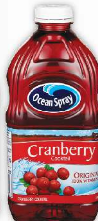
OCEAN SPRAY CRANBERRY COCKTAIL OR JUICE BLENDS OR MOTT'S CLAMATO COCKTAIL 1.77 - 1.89 L SELECTED VARIETIES