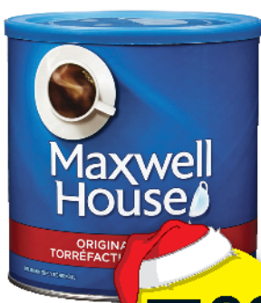
MAXWELL HOUSE GROUND COFFEE 900 - 925 G SELECTED VARIETIES