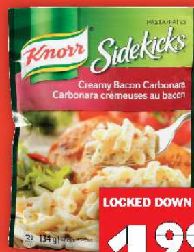
KNORR SIDEKICKS 120 - 132 G SELECTED VARIETIES