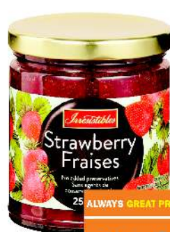
IRRESISTIBLES SPREAD 250 ML SELECTED VARIETIES