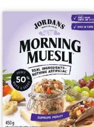
JORDANS MORNING MUESLI OR CRISP CEREAL 450 - 500 G SELECTED VARIETIES