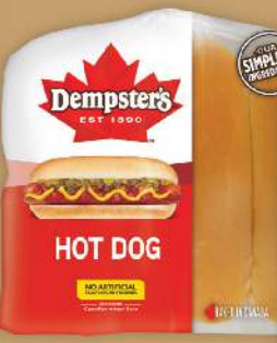
DEMPSTER'S WHITE OR 100% WHOLE WHEAT BREAD 675 G HOT DOG OR HAMBURGER BUNS PACK 8 SELECTED VARIETIES OR PAY $2.99 EA.