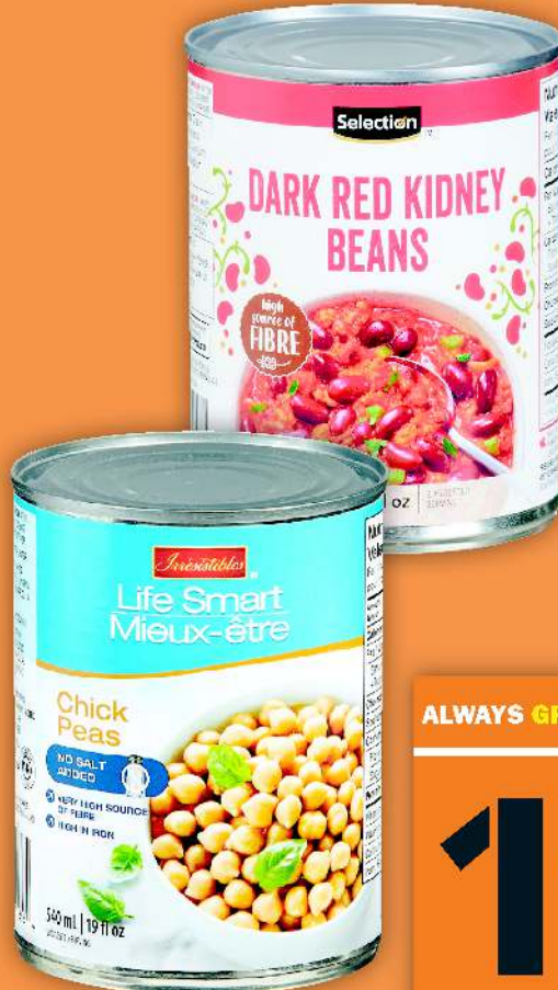
SELECTION OR IRRESISTIBLES LIFE SMART BEANS 540 ML SELECTED VARIETIES