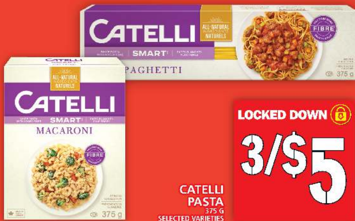
CATELLI PASTA 375 G SELECTED VARIETIES