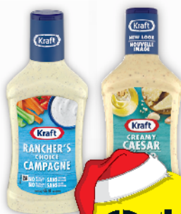
KRAFT SALAD DRESSING 475 ML SELECTED VARIETIES