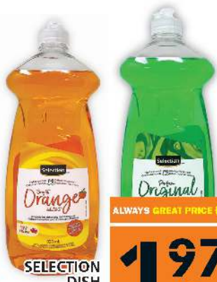
SELECTION DISH DETERGENT 591-828 ML SELECTED VARIETIES