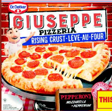
DR. OETKER GIUSEPPE RISING CRUST PIZZA 720 - 785 G EASY PIZZI 560 - 600 G FROZEN SELECTED VARIETIES