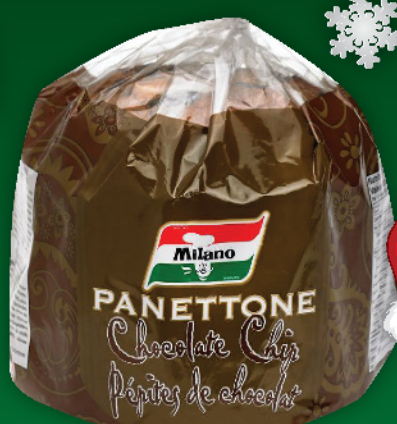
MILANO PANETTONE 800 G SELECTED VARIETIES WHILE QUANTITIES LAST