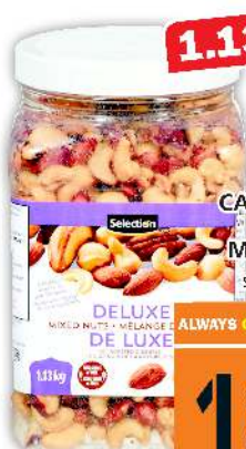
SELECTION CASHEWS OR DELUXE MIXED NUTS 1.13 KG SELECTED VARIETIES