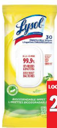
LYSOL DISINFECTING WIPES 30'S SELECTED VARIETIES