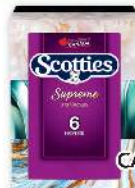
CASHMERE/BATHROOM TISSUE 12 = 24'S SPONGE TOWELS ULTRA OR SCOTTIES FACIAL TISSUE 6'S SELECTED VARIETIES