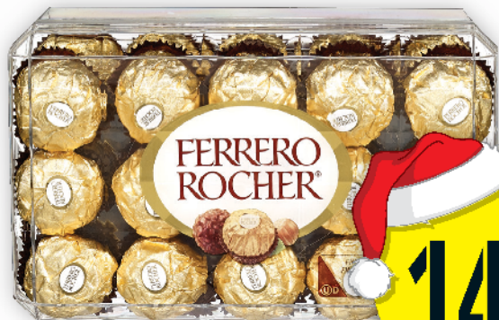
FERRERO ROCHER CHOCOLATE BOX 375 G SELECTED VARIETIES WHILE QUANTITIES LAST