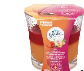
GLADE CANDLES EACH SELECTED VARIETIES