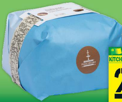
FIASCONARO PANETTONE 750 G SELECTED VARIETIES WHILE QUANTITIES LAST

ALL AISLES LEAD HOME KITCHENS OF THE WORLD 4/$5