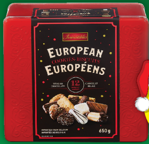
IRRESISTIBLES EUROPEAN COOKIES 650 G WHILE QUANTITIES LAST