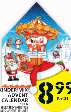
KINDER MIX ADVENT CALENDAR 182 G SELECTED VARIETIES WHILE QUANTITIES LAST