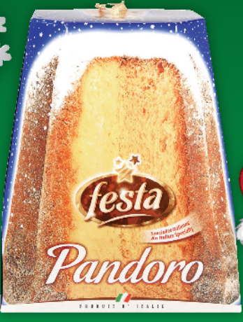
FESTA PANDORO OR PANETTONE 750 - 908 G SELECTED VARIETIES WHILE QUANTITIES LAST