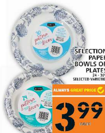
SELECTION PAPER BOWLS OR PLATES 24 - 30'S SELECTED VARIETIES