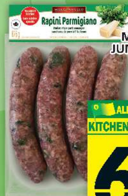
MARC ANGELO JUMBO PORK OR CHICKEN SAUSAGES 500 - 675 G FROZEN SELECTED VARIETIES

ALL AISLES LEAD HOME KITCHENS OF THE WORLD 6 99 EACH