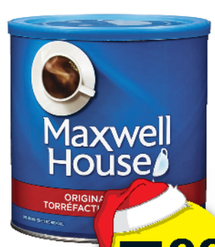
MAXWELL HOUSE GROUND COFFEE 900 - 925 G SELECTED VARIETIES