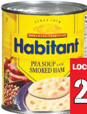
CAMPBELL'S CHUNKY OR HABITANT SOUP 515 - 795 ML SELECTED VARIETIES