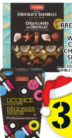
IRRESISTIBLES LICORICE, WINE GUM, CANDY OR CHOCOLATE SEASHELLS 250 - 350 G SELECTED VARIETIES WHILE QUANTITIES LAST