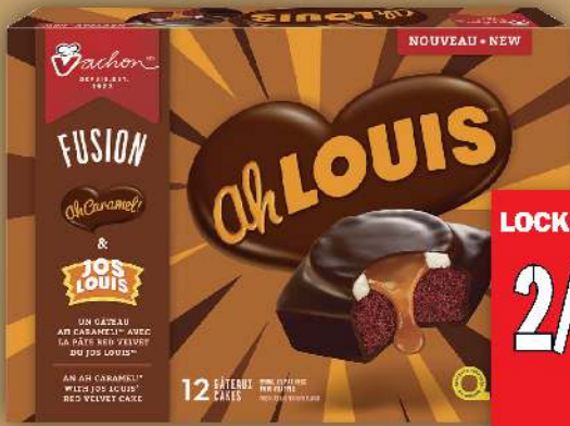
VACHON SNACK CAKES BOX OF 6 - 12 SELECTED VARIETIES OR PAY 3.69 EA.