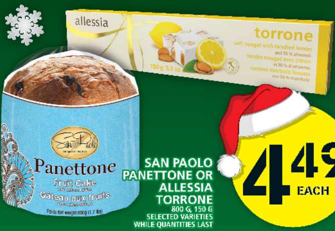
SAN PAOLO PANETTONE OR ALLESSIA TORRONE 800 G, 150 G SELECTED VARIETIES WHILE QUANTITIES LAST