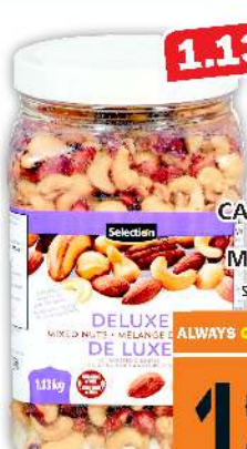
SELECTION CASHEWS OR DELUXE MIXED NUTS 1.13 KG SELECTED VARIETIES