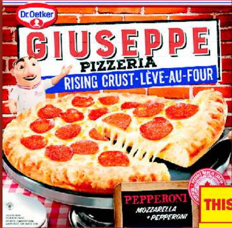
DR. OETKER GIUSEPPE RISING CRUST PIZZA 720 - 785 G EASY PIZZI 560 - 600 G FROZEN SELECTED VARIETIES