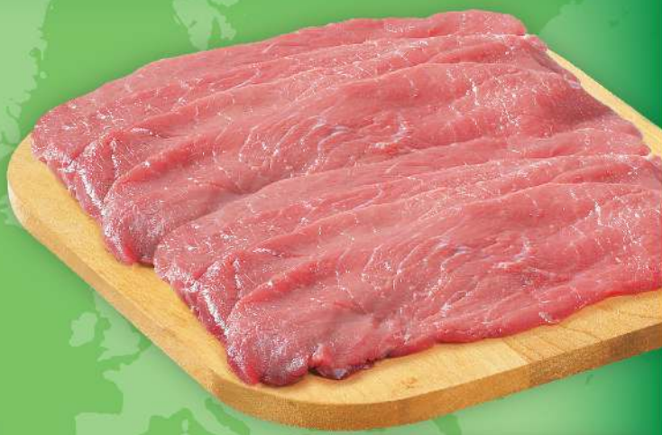
FRESH VEAL LEG CUTLETS FOR SCALLOPINI GRAIN-FED WHILE QUANTITIES LAST 26.43/KG

ALL AISLES LEAD HOME KITCHENS OF THE WORLD 3 99 EACH