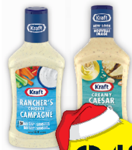
KRAFT SALAD DRESSING 475 ML SELECTED VARIETIES