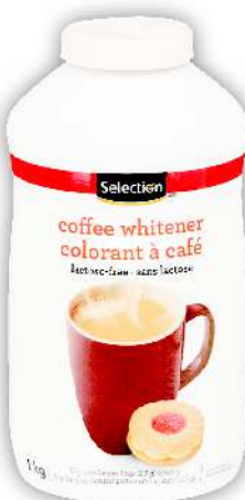
SELECTION COFFEE WHITENER 1 KG SELECTED VARIETIES