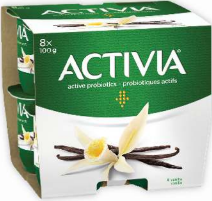
ACTIVIA YOGURT 8 X 100 G SELECTED VARIETIES