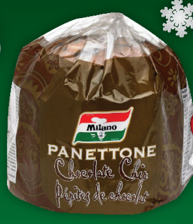
MILANO PANETTONE 800 G SELECTED VARIETIES WHILE QUANTITIES LAST