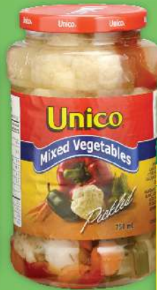
UNICO HOT PEPPER RINGS 750 ML SELECTED VARIETIES

ALL AISLES LEAD HOME KITCHENS OF THE WORLD 2 49 EACH