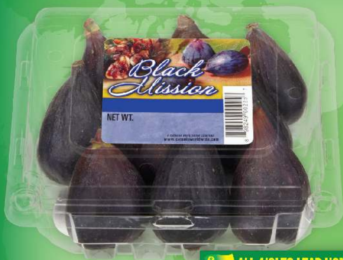
BLACK MISSION FIGS PRODUCT OF MEXICO 227 G

ALL AISLES LEAD HOME KITCHENS OF THE WORLD 3 99 EACH