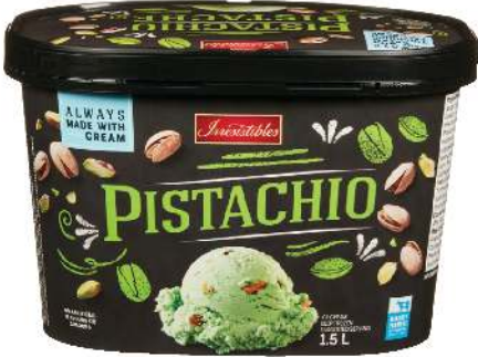
IRRESISTIBLES ICE CREAM 1.5 L NOVELTIES 4'S SELECTED VARIETIES