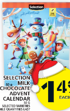
SELECTION MILK CHOCOLATE ADVENT CALENDAR 50 G SELECTED VARIETIES WHILE QUANTITIES LAST