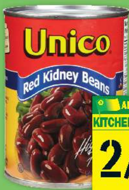
UNICO BEANS OR OLIVES 375 - 540 ML SELECTED VARIETIES

ALL AISLES LEAD HOME KITCHENS OF THE WORLD 2/$3