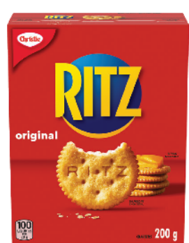
CHRISTIE RITZ OR WHEAT THINS CRACKERS 180 - 386 G SELECTED VARIETIES