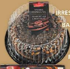
IRRESISTIBLES FULLY BAKED PIES 750 G - 1 KG, COFFEE CAKES 850 G OR 10" PUMPKIN PIE FROZEN 900 G SELECTED VARIETIES