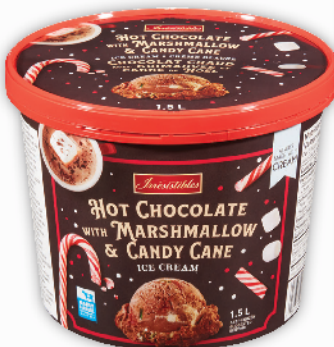
IRRESISTIBLES CANDY CANE ICE CREAM OR BARS 1.5 L, 6 X 55 ML SELECTED VARIETIES WHILE QUANTITIES LAST