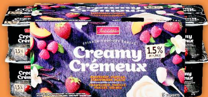
IRRESISTIBLES YOGOURT 12-16'S SELECTED VARIETIES