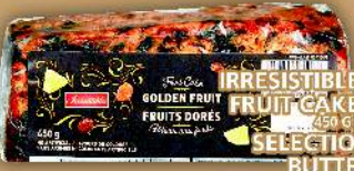
IRRESISTIBLES GOLDEN FRUIT CAKES 450 G OR SELECTION BUTTER COOKIES TRIO PLATTER 430 G SELECTED VARIETIES WHILE QUANTITIES LAST