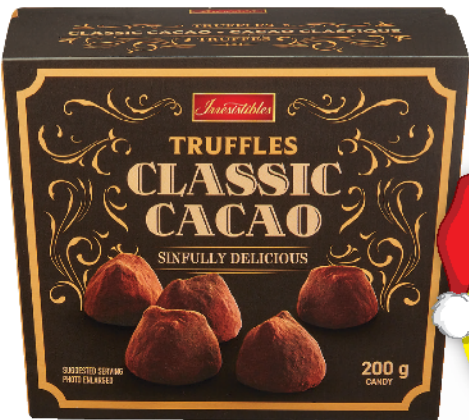
IRRESISTIBLES CLASSIC TRUFFLES 200 G SELECTED VARIETIES WHILE QUANTITIES LAST