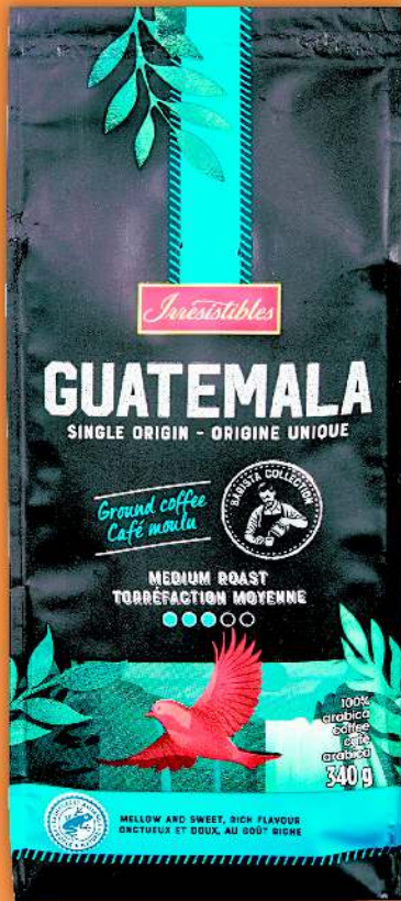
IRRESISTIBLES GROUND COFFEE 340 G SELECTED VARIETIES