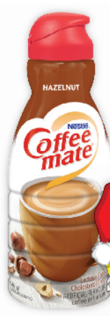
NESTLÉ COFFEE MATE COFFEE ENHANCER 946 ML SELECTED VARIETIES