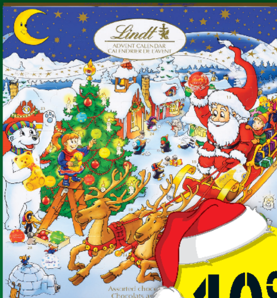
LINDT ASSORTED CHOCOLATE ADVENT CALENDAR 128 G SELECTED VARIETIES WHILE QUANTITIES LAST