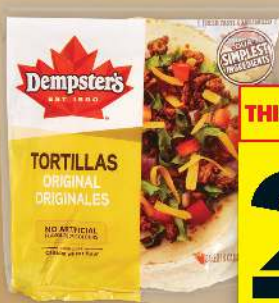
DEMPTER'S 100% WHOLE GRAINS BREAD 600 G OR 7" TORTILLAS 272 - 340 G SELECTED VARIETIES