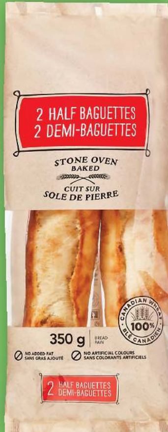
STONE OVEN BAKED HALF BAGUETTES 350 G

ALL AISLES LEAD HOME KITCHENS OF THE WORLD 4 99 EACH