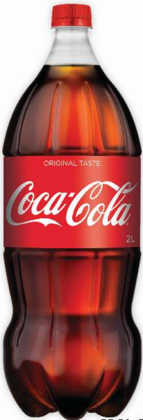
COCA-COLA, CANADA DRY, PEPSI OR 7UP 2 L SELECTED VARIETIES