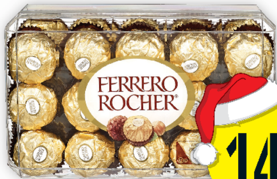
FERRERO ROCHER CHOCOLATE BOX 375 G SELECTED VARIETIES WHILE QUANTITIES LAST