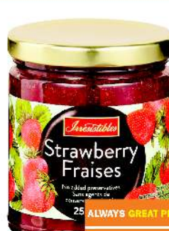
IRRESISTIBLES SPREAD 250 ML SELECTED VARIETIES