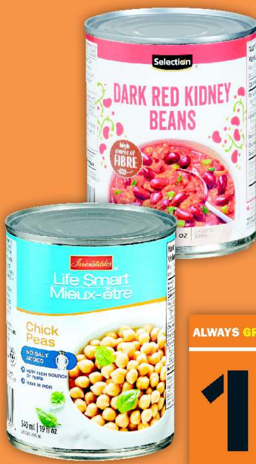
SELECTION OR IRRESISTIBLES LIFE SMART BEANS 540 ML SELECTED VARIETIES