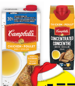
CAMPBELL'S BROTH 250 - 900 ML SELECTED VARIETIES