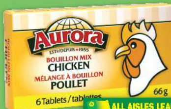
AURORA BOUILLON TABLETS 66 G OR DICED TOMATOES 398 ML SELECTED VARIETIES

ALL AISLES LEAD HOME KITCHENS OF THE WORLD 4/$5