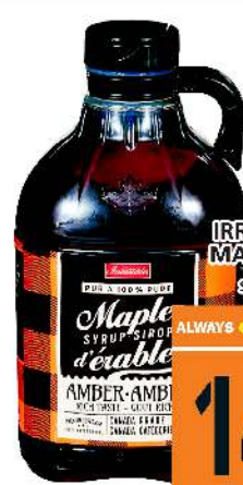
IRRESISTIBLES MAPLE SYRUP 946 ML SELECTED VARIETIES