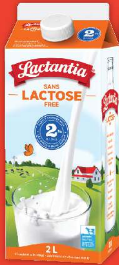
LACTANTIA LACTOSE FREE MILK 2 L OR BEATRICE CHOCOLATE MILK 3 L SELECTED VARIETIES