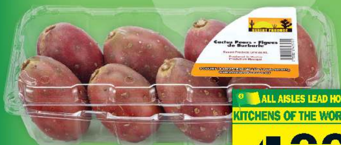
CACTUS PEARS PRODUCT OF MEXICO 907 G

ALL AISLES LEAD HOME KITCHENS OF THE WORLD 11 99 /L.B