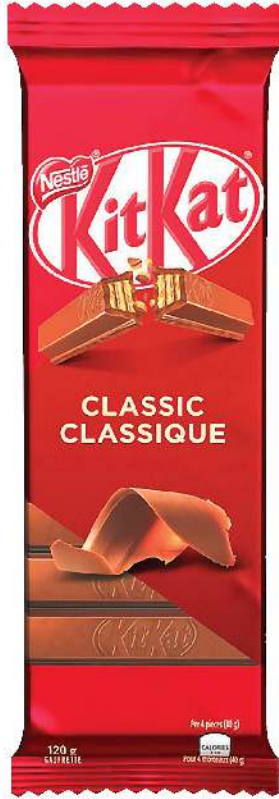
NESTLÉ OR CADBURY BARS 95 - 120 G SELECTED VARIETIES