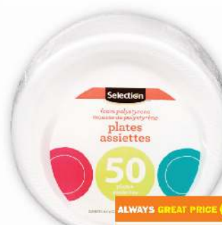
SELECTION FOAM PLATES 50'S SELECTED VARIETIES