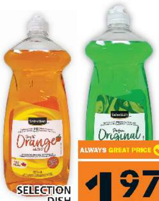
SELECTION DISH DETERGENT 591 - 828 ML SELECTED VARIETIES