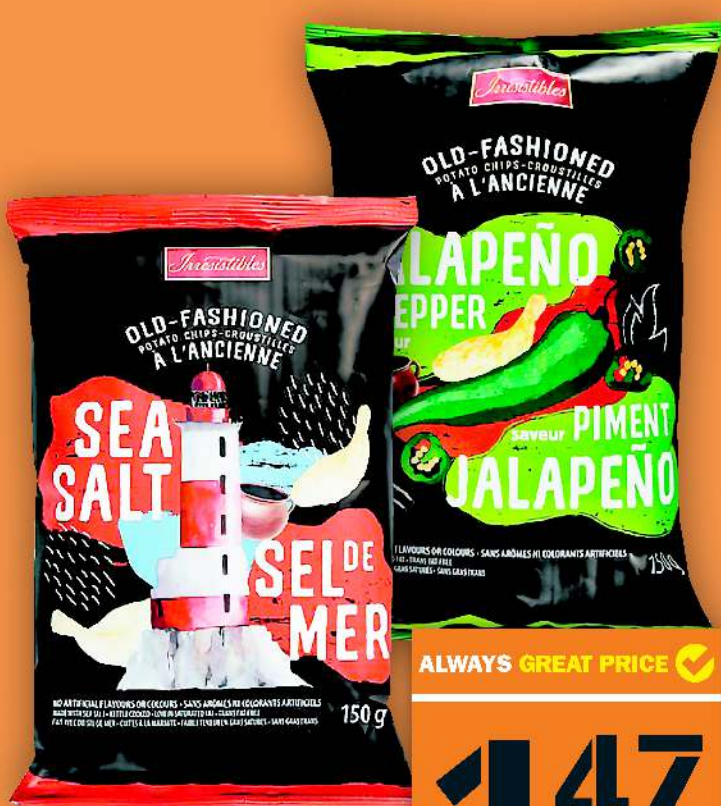
IRRESISTIBLES POTATO CHIPS 150 G SELECTED VARIETIES