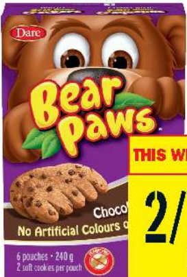
DARE ULTIMATE OR BEAR PAWS COOKIES 168 - 350 G SELECTED VARIETIES