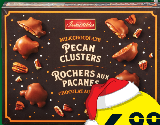
IRRESISTIBLES PECAN CLUSTERS 330 G SELECTED VARIETIES WHILE QUANTITIES LAST