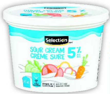
SELECTION sour cream 500 ML SELECTED VARIETIES